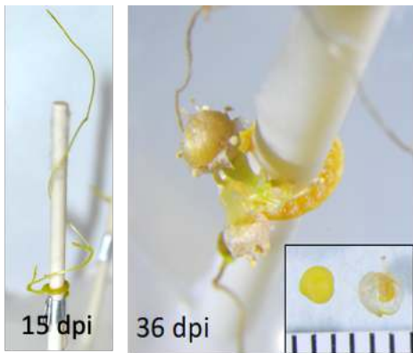
C. campestris growing in an AHS

closed sterile container, exposure to far-red light to induce coiling and haustoria, and a liquid media with proper nutrients and phytohormones. Inclusion of an auxin and a cytokinin in the media increased parasite fresh weight and biomass, and media containing cytokinin increased parasite shoot length. Transcriptomic analysis comparing haustorial regions and new shoots of parasites growing in the AHS, independent of any interaction with a plant host, showed that haustorial regions present an enrichment in biological process related to circadian rhythm; metabolic and catabolic processes; lignin biosynthetic and xylem development; transport; response to abiotic and chemical stress, and defense response. On the other hand, stems present enrichment in gravitropism, cuticle and cell wall-related biosynthetic processes, organ morphogenesis, stomatal morphogenesis, among others.