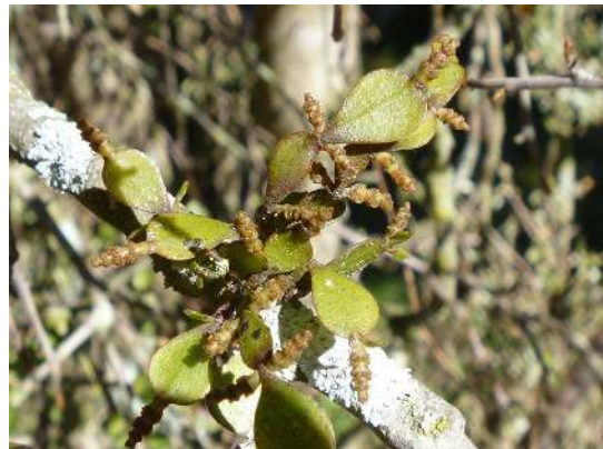
A pygmy mistletoe ( Korthalsella lindsayi ) growing on weeping matipo ( Myrsine divaricata ) in the forest block.

The bush also contains mānuka ( K. clavata ) which is classified as a species in decline across New Zealand.