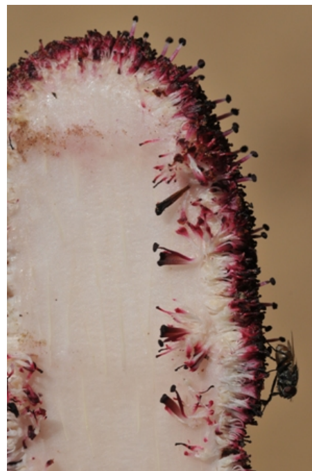
Close-up of flowers of C. coccineum .

Extensive research has dealt with the chemical composition, bioactive compounds, antimicrobial activities, and pharmacological effects of Cynomorium (see Leonti et al., 2020; Patočka and Navátílová, 2020). The anatomical and ecophysiological relationships of the target parasite to its hosts, have received relatively little attention. For example, Fahmy and Hassan (2021) described for the first time the anatomy and ultrastructure of the haustoria of C. coccineum infecting two halophytes.