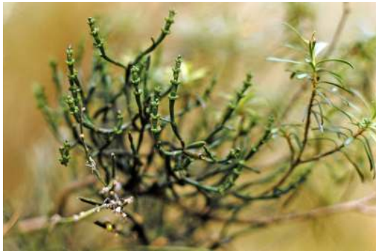
Korthalsella salicornioides

which occurs on kānuka (also on Leptospermum scoparium ).