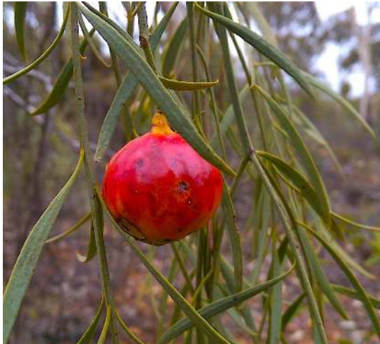
Figure 1. Fruit of quandong – Santalum acuminatum

Most studies on the genus Santalum have focused on the sandalwood species and how to increase their yield either through suitable host trials or other environmental field experiments. Though looking at host preferences for Santalum in an ecological context has been lacking.