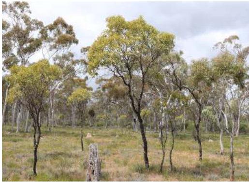
Figure 3. Quandong trees up to 3 m in height and are still relatively young of age, growing in an open clearing surrounded by Wandoo ( Eucalyptus ) woodland

growing on a quandong, an example of hyper-parasitism (Fig. 4).