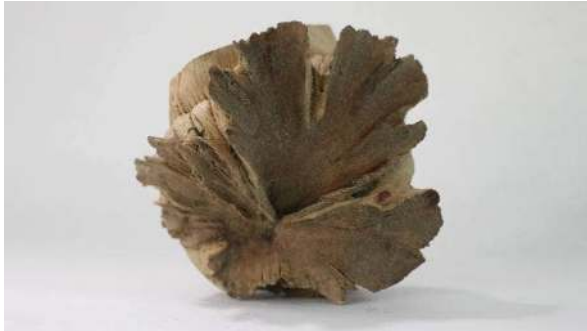
Wood rose, caused by the parasitic plant Pua o te Rēinga, meaning ‘flower of the underworld’.

In nearby locations like Pureora Forest Park, they tended to flower around March. Mudge estimated a group of 30 or so flowers, each with a lifespan of only 7-10 days, would produce collectively 0.5mL of nectar in that time. But flowers were something that wouldn't be seen for at least five years, as the plant was slow to germinate and start growing – if they grew at all.