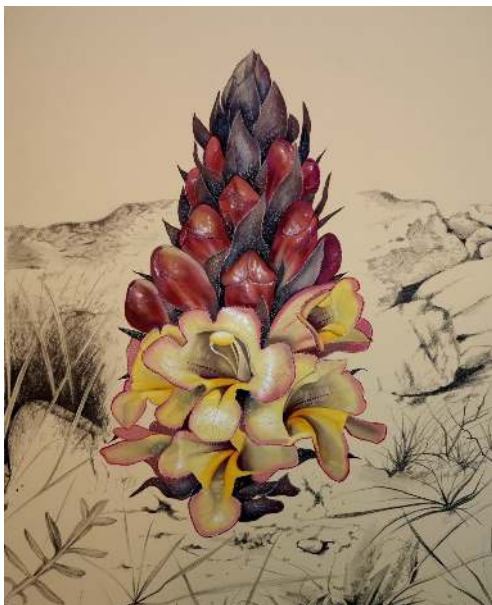
Painting by Chris Thorogood of Cistanche fissa in Israel.

https://www.oxfordsparks.ox.ac.uk/content/facebook-live-worlds-largest-flower