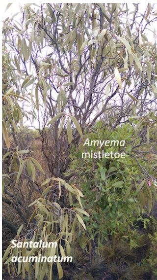
Figure 4. Quandong being parasitised by another plant parasite – an Australian mistletoe species ( Amyema )