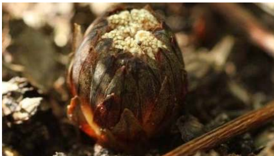
The flower of Dactylanthus taylorii .

The three planting sites were carefully chosen; one at the head of a river, to encourage the spread of seeds downstream; one just off the trail in the cool, moist earth of the bush; and one where there was a small population of mice, to see if their presence affected its growth. The flowers would hopefully provide a rich food source for nectar feeding animals, and it would be interesting to see which animals became the main clientele.