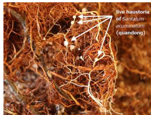
Figure 2. Live haustoria of quandong attached to a host ( Acacia saligna ).

Due to a combination of strong host specificity, rare local establishment, and the slow growing nature of this species, there has been no incentive and indeed little purpose for the control of this parasite in terms of its management. This is in stark contrast to other more invasive herbaceous parasites commonly found in the Northern Hemisphere (e.g. Striga ). The Australian large flightless emu bird is a well known seed dispersal agent of quandong. Getting quandong seeds to germinate is difficult in horticulture, and is said to be significantly aided by feeding them to an emu and collecting the remains of their scat after, with the kernels digested but seed intact. Quandong is slow growing and once established, will persist in the landscape for many years (50–100 years or more), often growing into large shrubs. On some occasions I have seen them as tall trees though this is rare, and these are found in areas that get higher rainfall than in more arid parts of its distribution (Fig. 3).