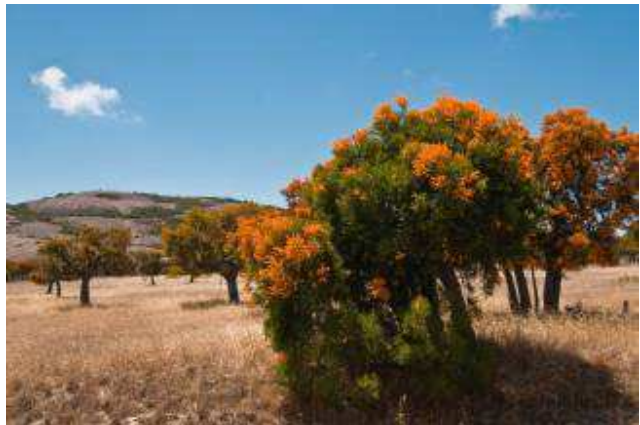
Photo: Nuytsia floribunda , the Australian mistletoe, in bloom in Western Australia. (Flickr: Graeme Churchard)

were so beautiful,' she told 720 ABC Perth. 'What we have been doing is looking at the trees that were left amongst houses and parkland and found that most of those have disappeared. 'The trees that were in patches of urban bushland were still there.' We think about 90 per cent of the trees that are not in bushland have disappeared. In bushland nearly 100 per cent have remained.'