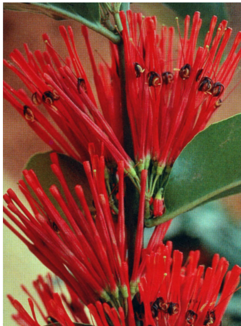
Englerina gabonensis

In a search of my Endnote reference database that contains all of the citations listed in past Haustorium newsletters the name Loranthus micranthus was used in the following journals: African Journal of Biotechnology, American Journal of Pharmacology and Toxicology, Asian Journal of Biomedical and Pharmaceutical Sciences, Asian Pacific Journal of Tropical Medicine, Bio-Research, Current Research, Drug plants, European Journal of Medicinal Plants, Fitoterapia, International Journal of Pharma and Bio Sciences, Journal of Ethnopharmacology, Journal of Pharmacy and Pharmacology, Journal of Tropical Medicine, Pharmaceutical Biology, and Phytopharmacology and Therapeutic Values. I then searched for this binomial using Google Scholar and added the following journals: Biochemistry Research International, Current Research Journal of Biological Sciences, Evidence-Based Complementary and Alternative Medicine, Global Advanced Research Journal, Journal of Pharma and Bio Sciences, Journal of Pharmaceutical and Allied Sciences, Natural Product Research (Formerly Natural Product Letters), Pharmaceutical Biology, Phytochemistry Letters, Planta Medica, Research Journal of Medicinal Plant, and Scientia Africana. Although some of these journals are from developing nations, others are from the United States and Europe, demonstrating that this taxonomic problem is not being detected among a wide range of authors, journals, reviewers, and editors.